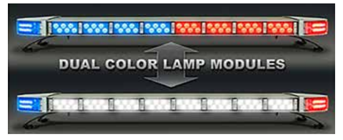
Sample rear dual color configuration